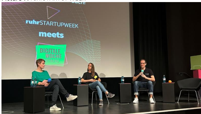
Picture 7. ruhrSTARTUPWEEK