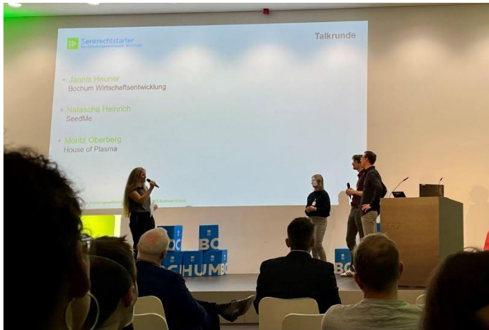
Picture 8. Senkrechtstarter