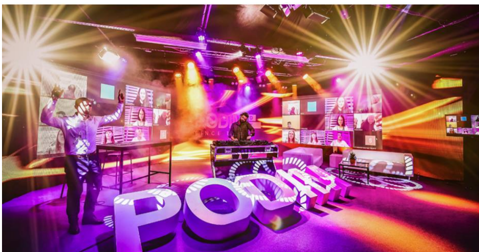
Picture 1. Podium conference

Source: https://podim.org/podim-dx-conference-lights-up-the-european-startup-scene-once-again/