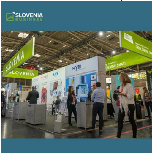
Picture 3. Presentations of Slovenian companies 2023

Source: https://www.linkedin.com/posts/slovenia-business_spiritslovenia-activity-7019287983811903488-E6pm/?originalSubdomain=rs