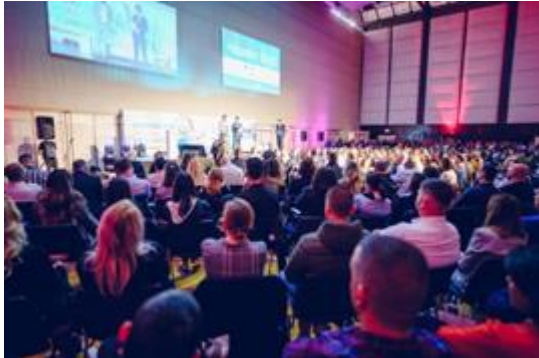
Picture 6. InnoWave Summit

The partners of the Innowave Summit are the European Commission, Transilvania IT Cluster, France Digital, Cluster Catalonia, Pro Malaga, Valencia Digital Summit, the Bulgarian-British Chamber of Commerce, AI Bulgaria, BAIT, the Bulgarian Association of Software Companies, the Bulgarian Center for Entrepreneurship, SoftUni Digital and many other.