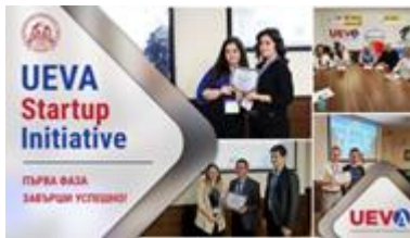
Picture 5. UEVA

The University of Varna provides financing for UEVA. It receives financial support from the businesses and its partners. The accelerator also participates in initiatives at the international level supported by European programs.