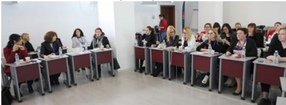
Picture 4. An event of the Women Entrepreneurship Centre

In 2024, the Center will continue operating, delivering training, and organising other activities under Interreg Danube Region project DRP0200020 – WE.Circular-Boosting digital and industrial capacity for sustainable circular transition of women entrepreneurs in the Danube Region.